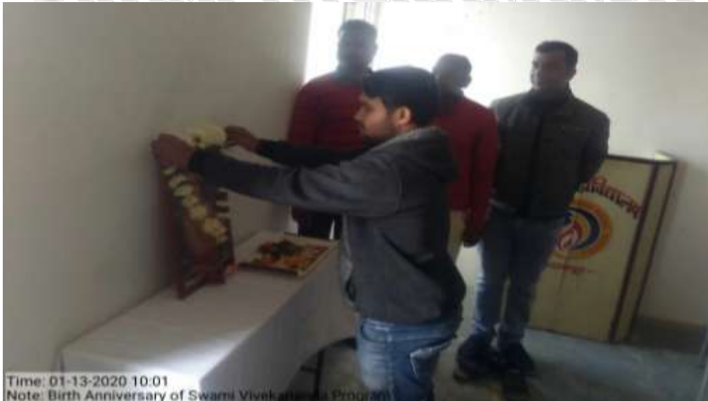
Time: 01-13-2020 10:01 Note: Birth Anniversary of Swami Vivekananda Program