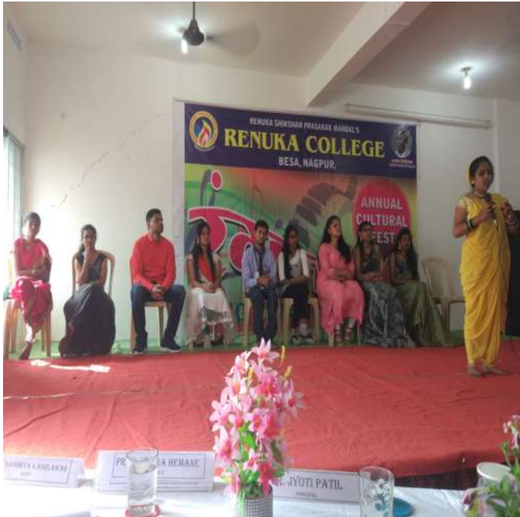
Best Student of the Year 2020