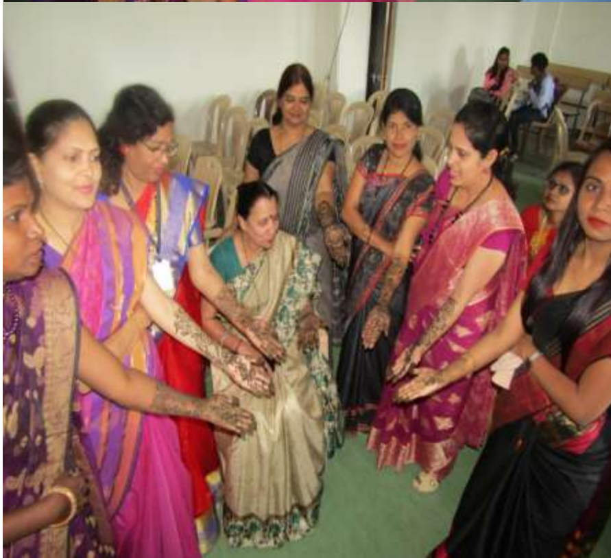
Students Participated in Intra-Collegiate Mehendi Competition