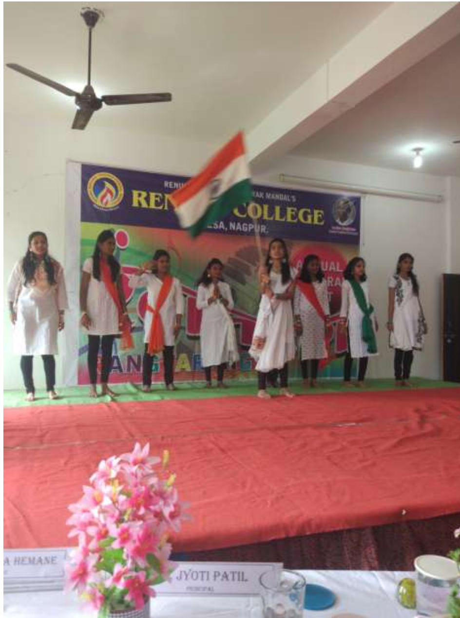
Students presented Group Dance in Intra-Collegiate Competition