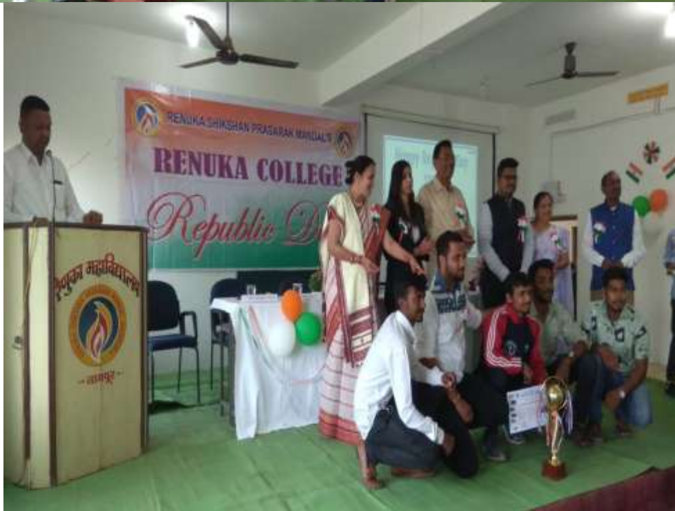
Students receives Prize by Chief Guest