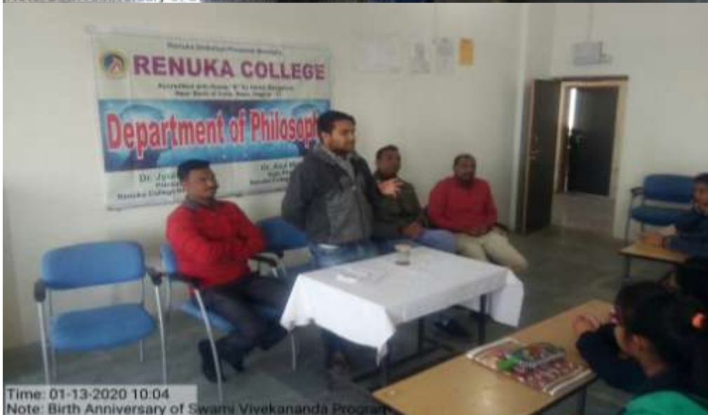
Time: 01-13-2020 10:04 Note: Birth Anniversary of Swami Vivekananda Program