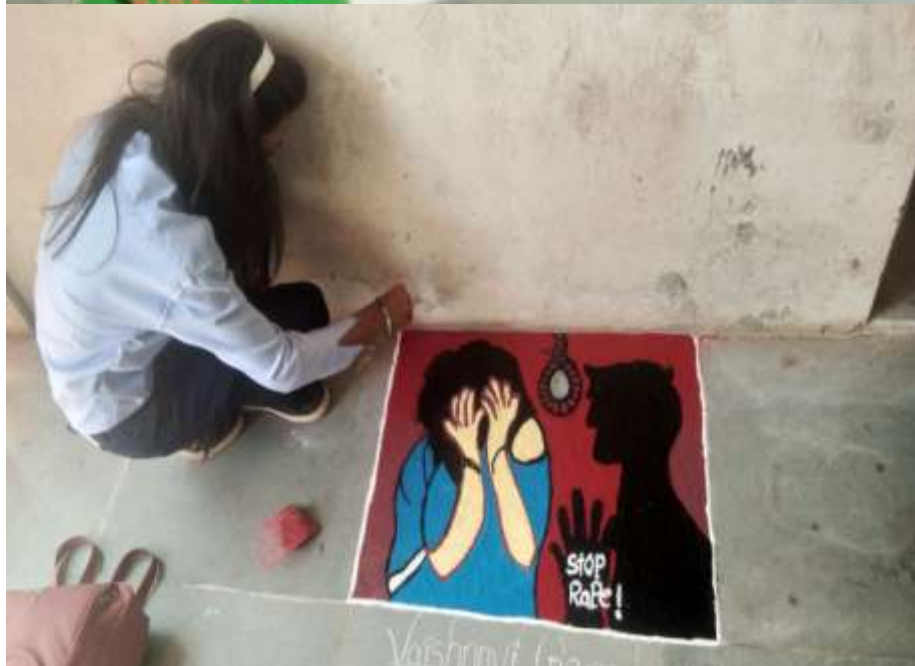
Judges inspecting and examining the Rangoli Decoration Intra-Collegiate Competition